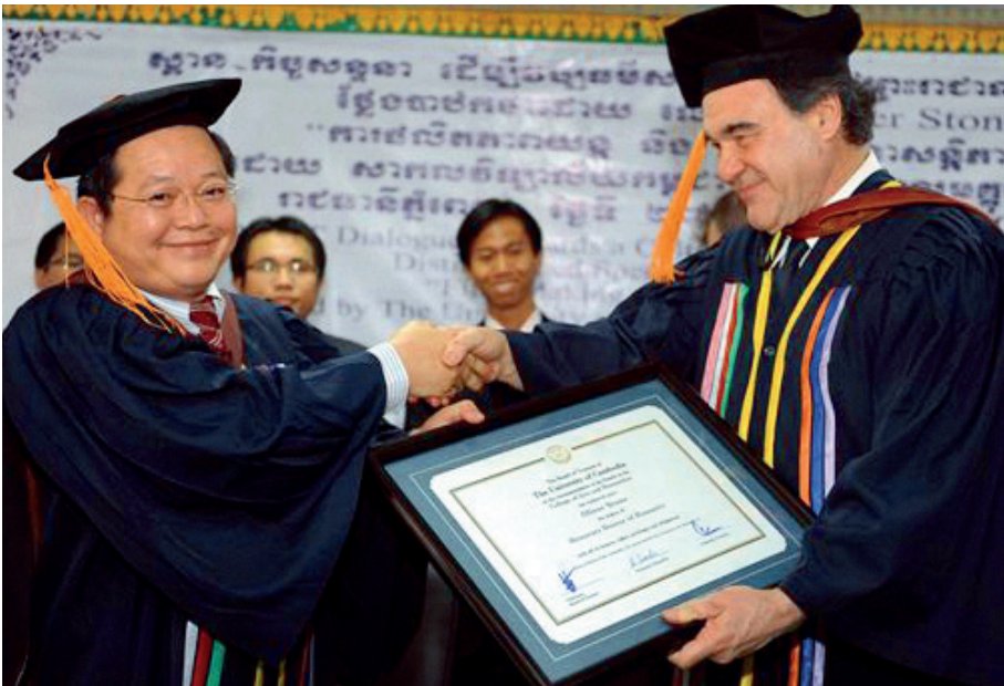
Oliver Stone honoured

Stone insists he's no enemy of capitalism. He just feels the financial system has become rotten and needs urgent reform. “Wall Street is supposed to be the engine of growth for America. But banks have